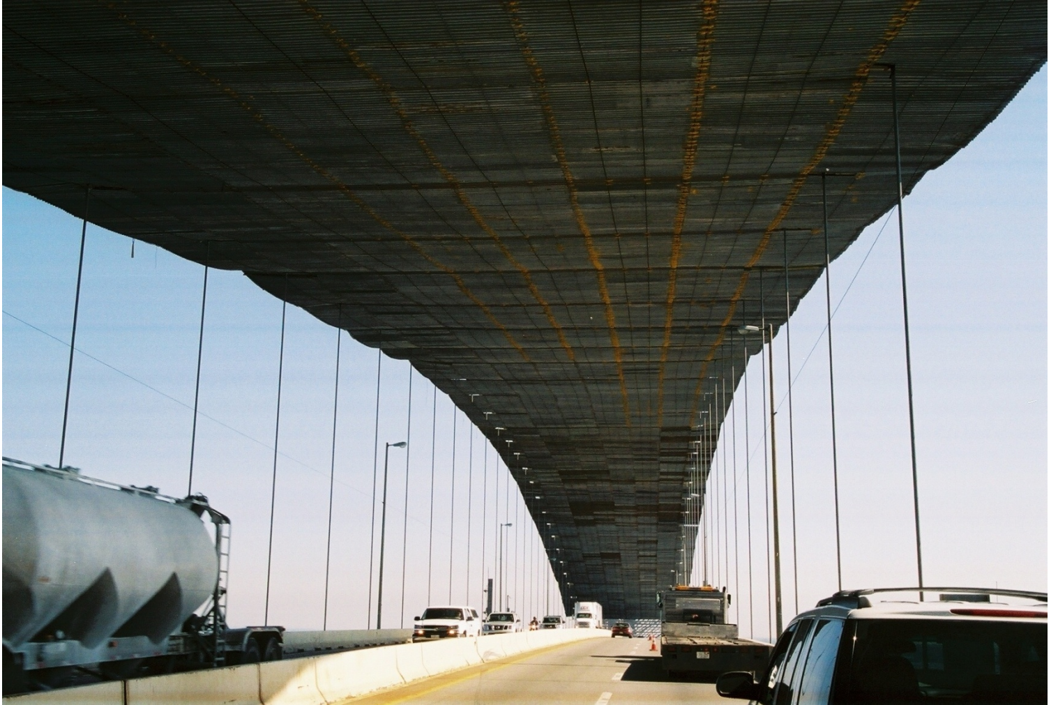
Upper Level Cable Supported/Metal Deck Platform System