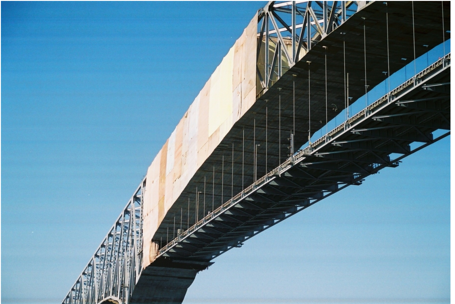
Upper & Lower Level Cable Supported/Metal Deck Platform System & Containment