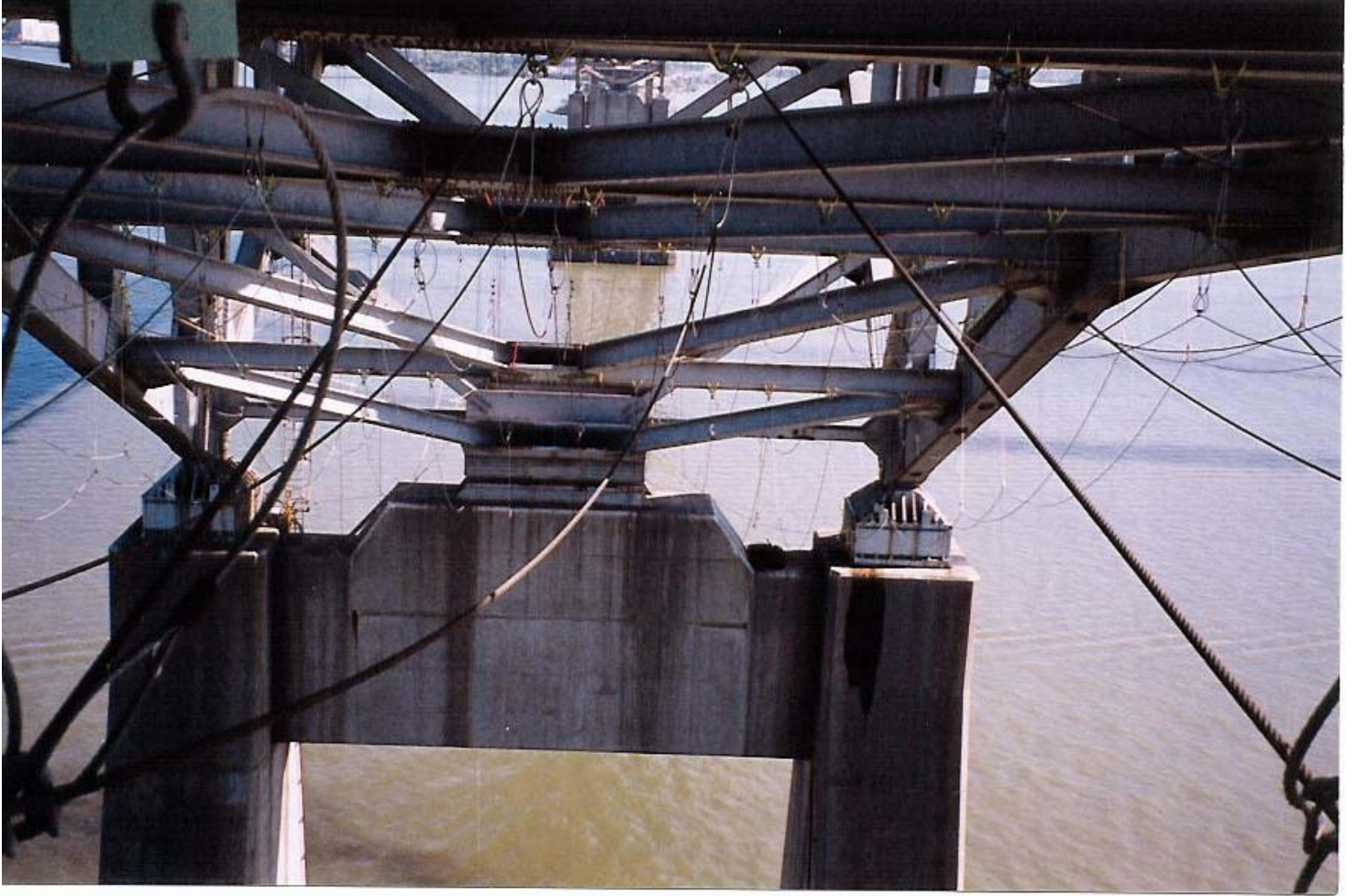
Main Cable Installation