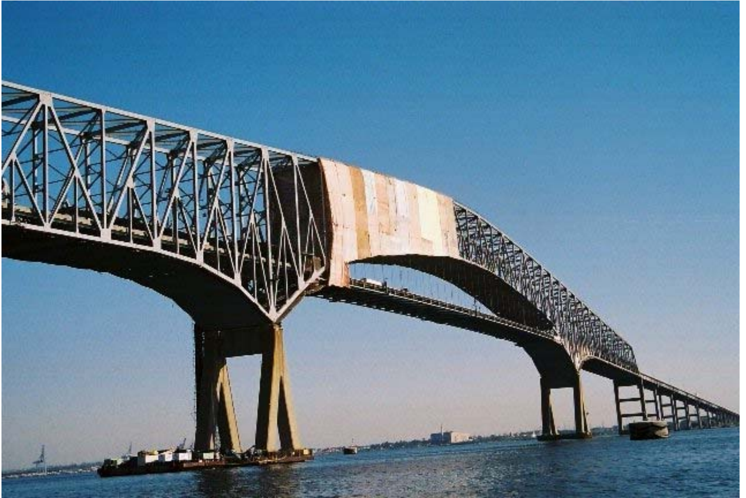
Upper & Lower Level Cable Supported/Metal Deck Platform System & Containment