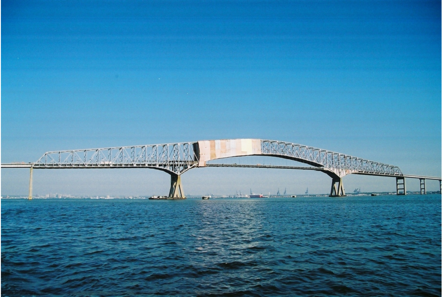
Upper & Lower Level Cable Supported/Metal Deck Platform System & Containment