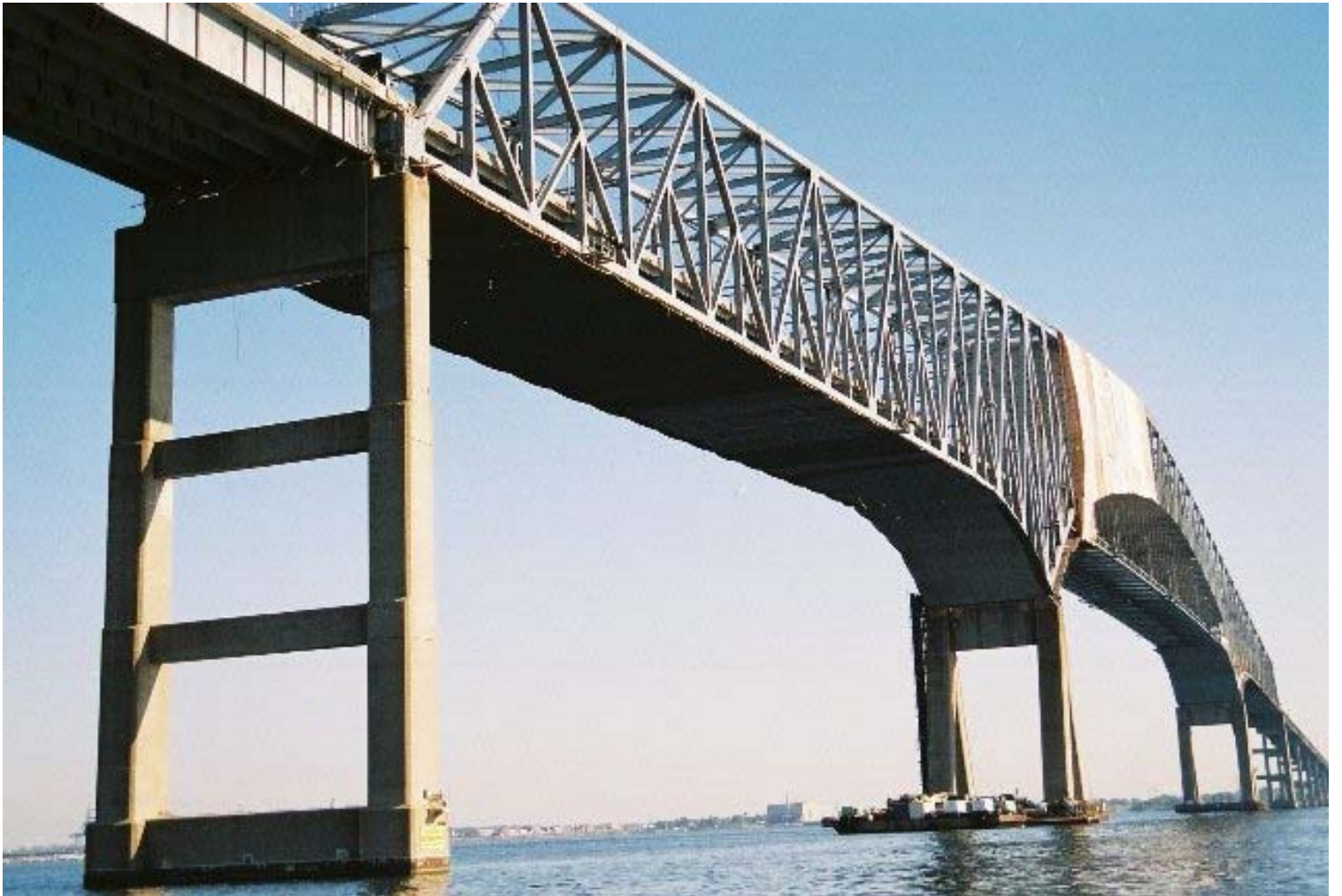
Lower Level Cable Supported/Metal Deck Platform System & Containment