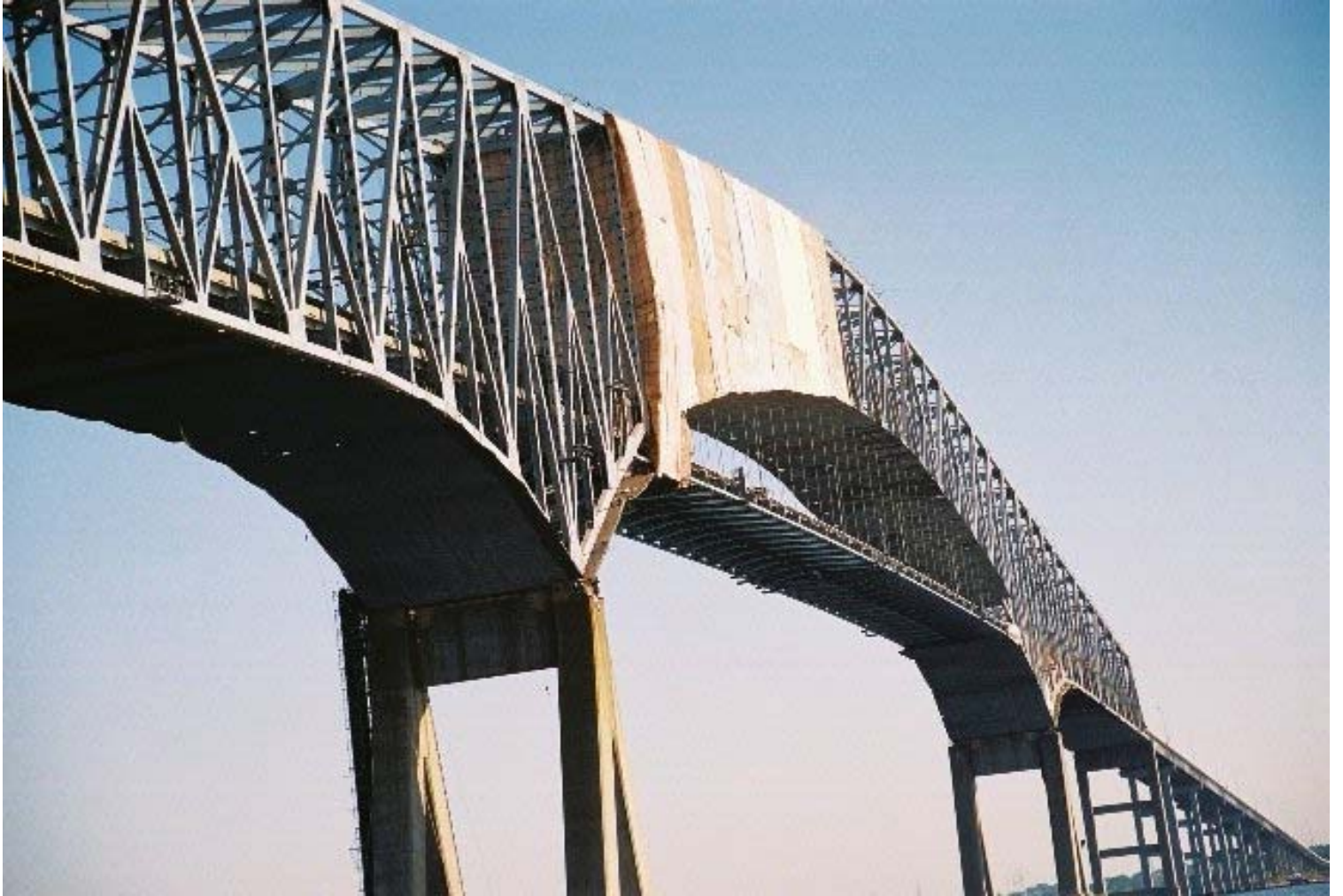
Upper & Lower Level Cable Supported/Metal Deck Platform System & Containment