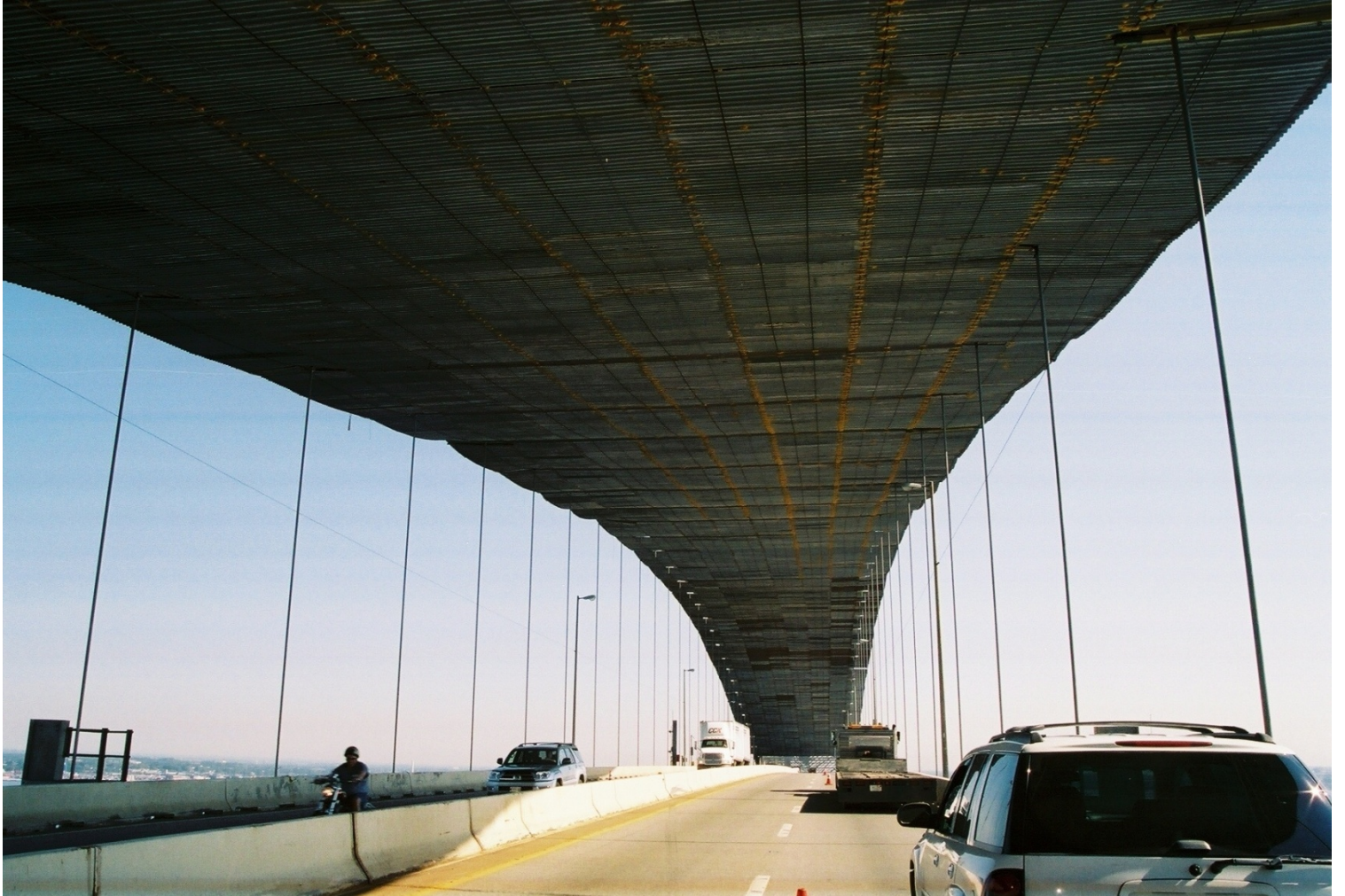
Upper Level Cable Supported/Metal Deck Platform System