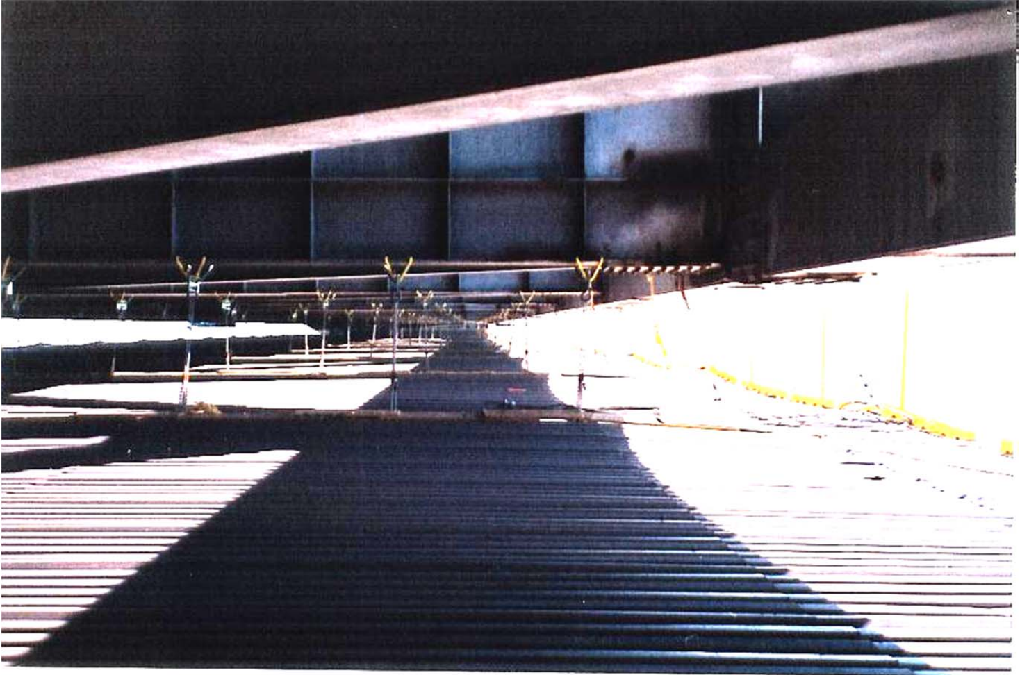
Lower Cable Supported/Metal Deck Platform System